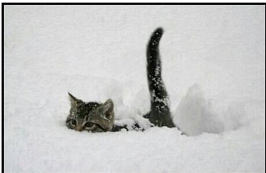
When I Find That Damn Groundhog I'm Gonna Kick His Ass!

All of his life Ole had heard stories of an amazing family tradition. It seems that his father, grandfather and great-grandfather had all been able to walk on water on their 21st birthday. On that day, they'd walk across the lake to the boat club for their first legal drink. So when Ole's 21st birthday came around, he and his pal Corky took a boat out to the middle of the lake.